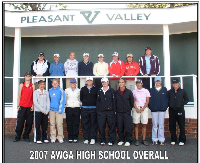
2007 AWGA HIGH SCHOOL OVERALL