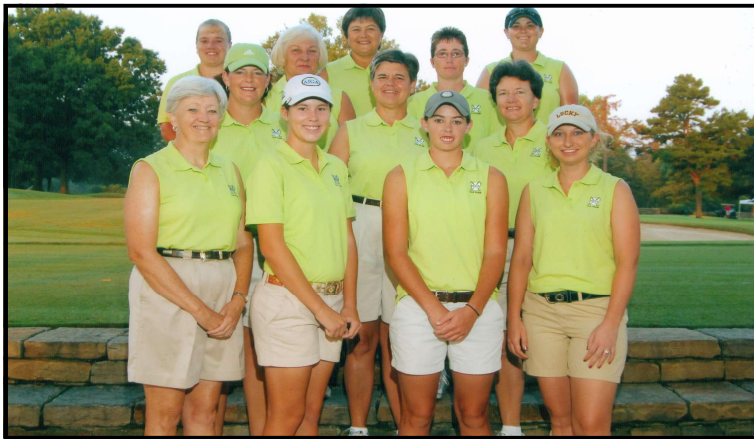
2007 Fore States Team:

compete for a place on the Arkansas Fore States-Wertz Cup Team must be a dues paying member of the Arkansas Women's Golf Association ($15.00) and must have played in at least one AWGA State Match Play Championship, AWGA State Stroke Play Championship, AWGA State Girls Junior Championship or AWGA Designated Tournament within the last three years. The first eight places on the team will be determined based on total points earned between July 1 st of the previous year through June 30 th of the current year and the remaining two places are selected by the team Captain.