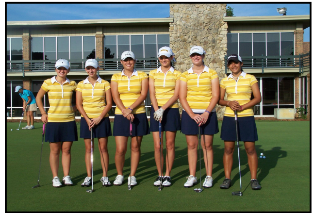
2007 Tri-States Team: