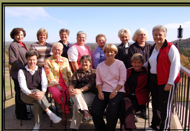
The 2008 AWGA Board of Directors

Whether you are a tournament player or a sustaining member of our organization, we appreciate your support.