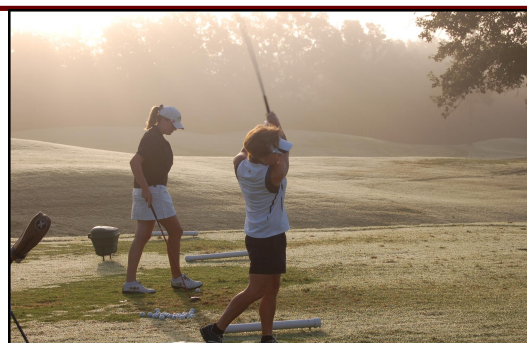
On the range...in the fog... at Bella Vista

rgarris@ipa.net , 479-876-6746 or 479-619-5595.